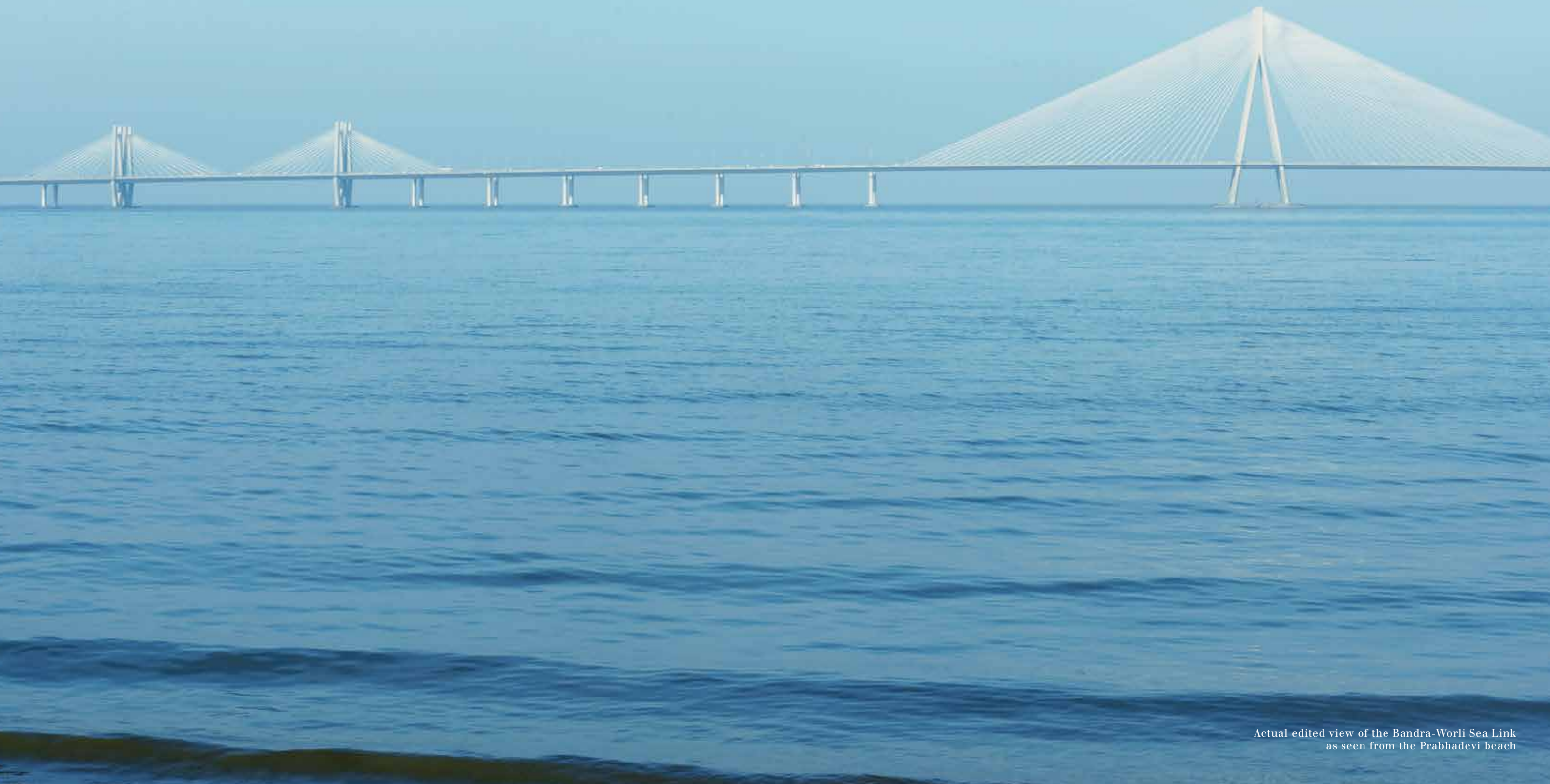
Actual edited view of the Bandra-Worli Sea Link as seen from the Prabhadevi beach

For years, Prabhadevi has retained its glory as an upscale neighbourhood in South Mumbai. Being closest to the sea, this sought after locality comes with breathtaking views and the tranquillity of the bay that is only enjoyed by a privileged few. An envied neighbourhood in the real estate market, Prabhadevi takes pride in displaying some of the most extravagant high-rise buildings in Mumbai's skyline.